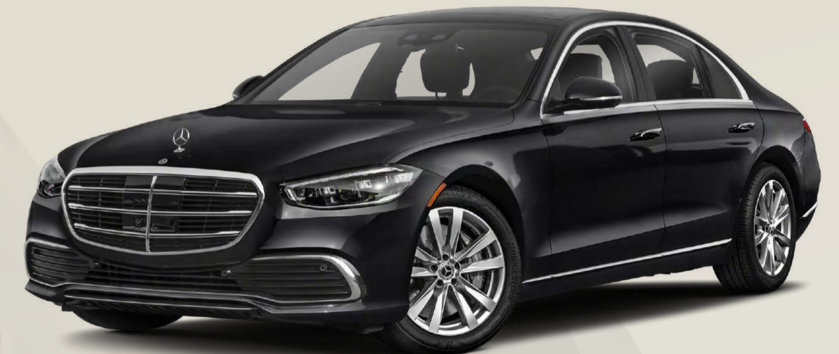
Mercedes S Class