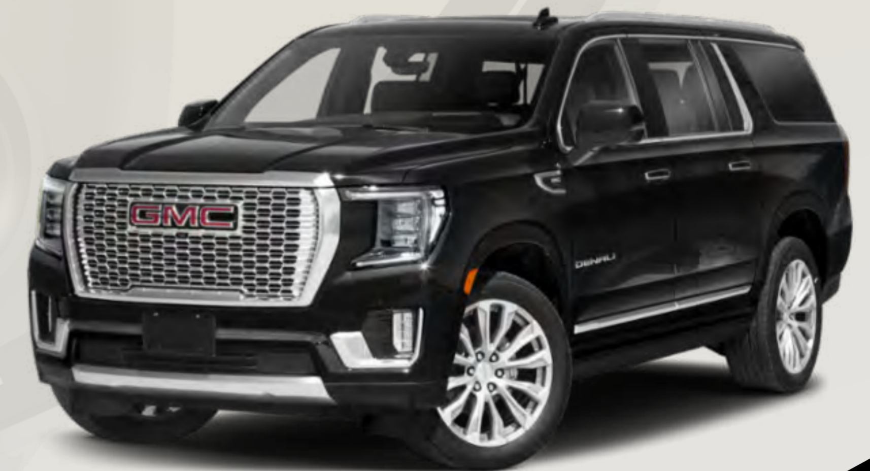
GMC Denali Yukon