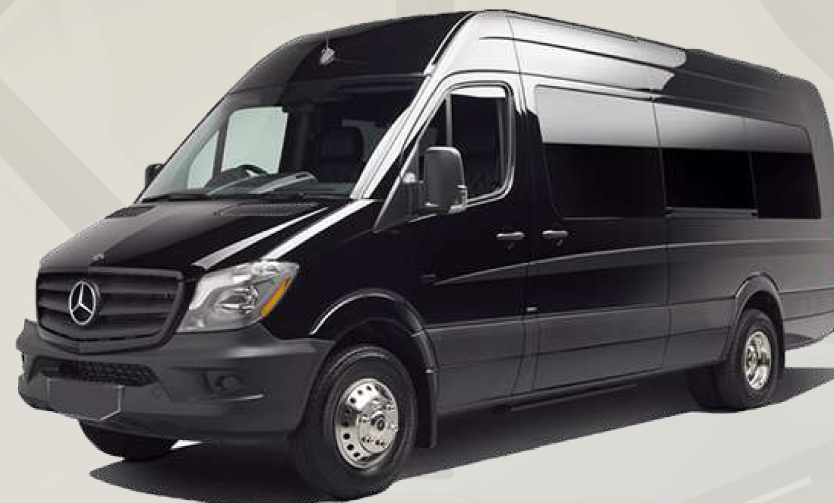
Mercedes Sprinter Passenger